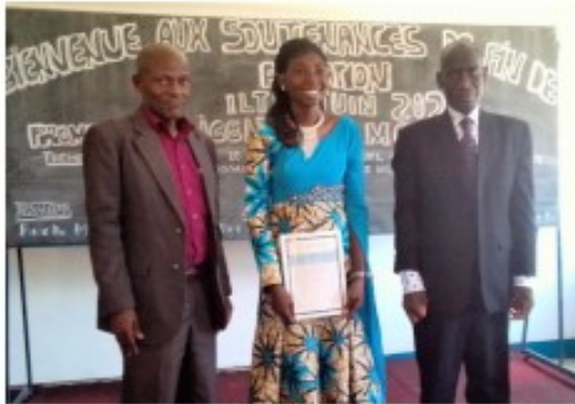
Smiles after a successful "soutenance."

It has been way too long since my last newsletter, and for that, I sincerely apologize. Already another academic year has come to a close at the Lutheran Institute of Theology in Meiganga.