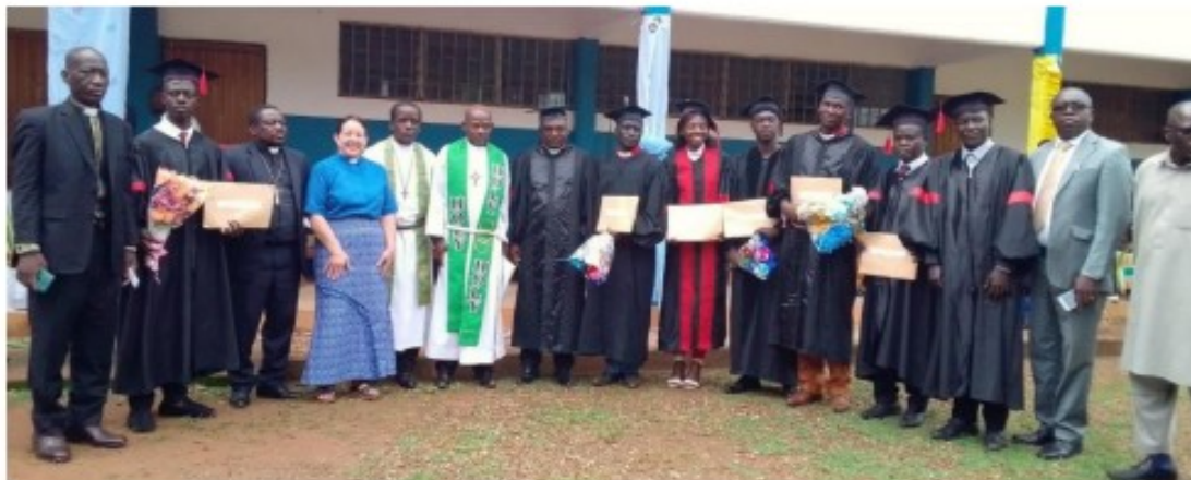
Graduation day -- June 19, 2021

This year we had seven graduates from the "licence" program (equivalent of a B.A.) and one graduate from the master's degree program.